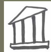
Court of Appeals